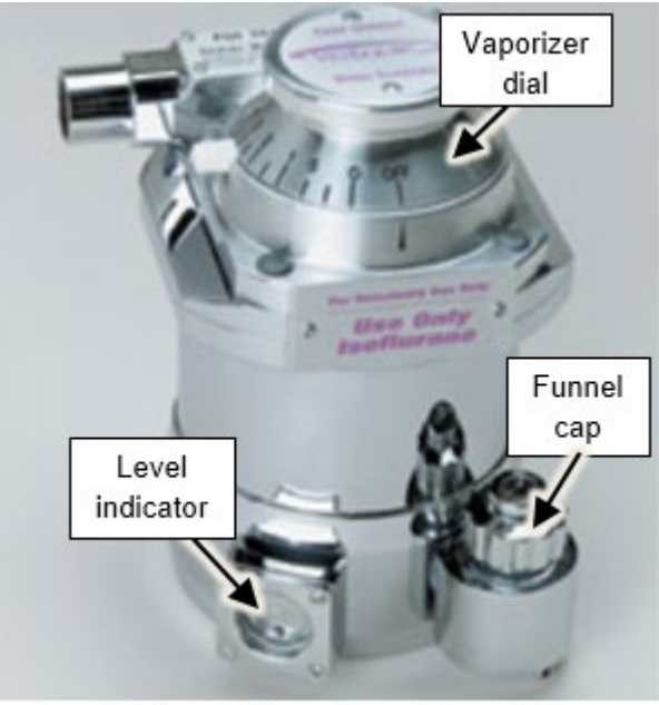
Isoflurane Vaporizer - funnel fill