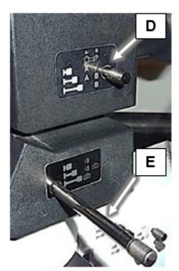
Light Path levers