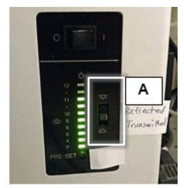
Transmitted Light flip switch