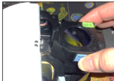
Handle sides only, lift out