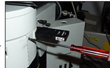
Push in turret and tighten