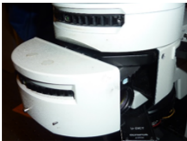
Carefully remove turret