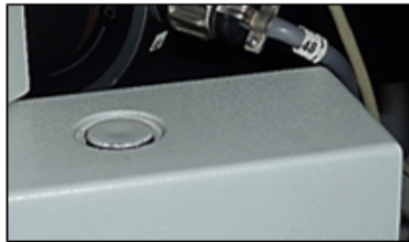
Find screwdriver on right of scope