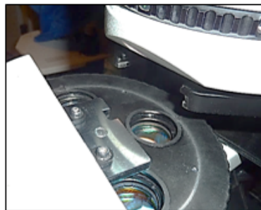
Turn over and slide into notches