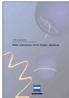
Short Protocol RNA extraction from frozen sections