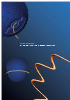
LCM Protocols RNA handling