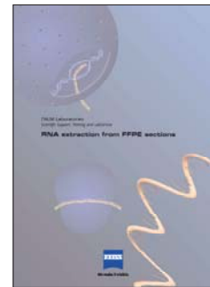
Short Protocol RNA extraction from FFPE sections