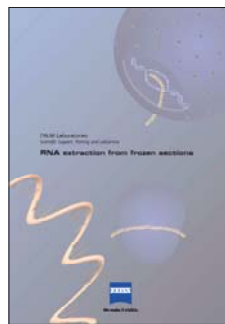
Short Protocol RNA extraction from frozen sections