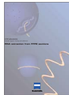
Short Protocol RNA extraction from FFPE sections

Carl Zeiss MicroImaging Location Thornwood, NY